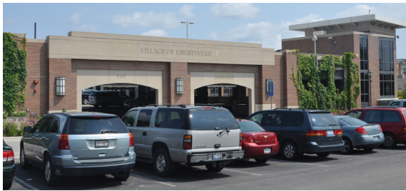
Lake Street Parking Garage

Visiting all the wonderful businesses and festivities in downtown Libertyville has never been easier. In addition to several surface parking lots, the Village is pleased to offer over 600 parking spots between the two parking garages. The north garage is at the southeast corner of Brainerd Avenue and Lake Street. The south garage is at the southeast corner of Brainerd and Church. The structures provide FREE 4-HOUR customer parking on ground floor and upper levels, as well as employee parking on the lower level. Please note, no commuter parking is permitted in the garages.