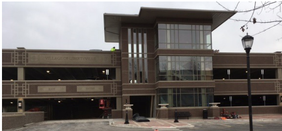
Church Street Parking Garage

The Village of Libertyville offers many shopping, dining, entertainment and recreational activities. With approximately 100 restaurants and taverns, 25 retail centers, a historic downtown and year-round events, there's plenty of activities for residents and visitors alike.